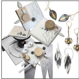
Tools and Jigs