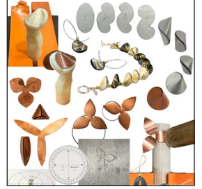
Prototype to Production