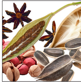
Seeds and Pods Making Beads