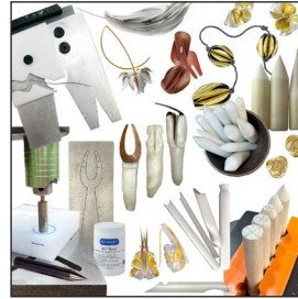
Forming for Multiples