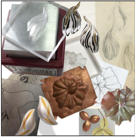
Dies Three Ways

www.jayneredmanjewelry.com jayneredman@me.com