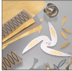
A Touch of Gold: The Keum-boo Process