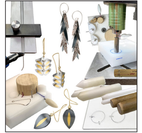
Tools and Jigs