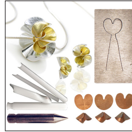
Prototype to Production