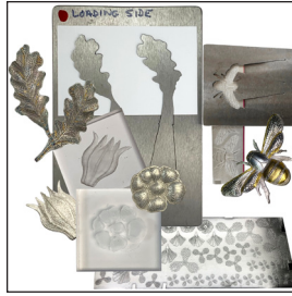
Imagery on Die Formed Silver