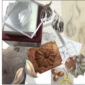
Dies Three Ways