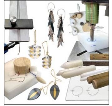
Tools and Jigs for Multiples