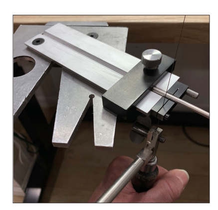
Jig mounted on Jayne Redman® Rotational Bench Pin for hands free use. This is my position for sawing left handed.