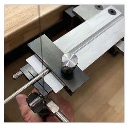
This is my recommended position for sawing right handed.